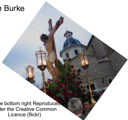
Image bottom right