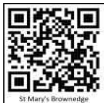
St Mary's Brownedge

MARRIAGE MATTERS: Third Sunday of Advent "Cherish the gift" - John the Baptist prepared the way for Jesus' coming. When Jesus came, the Magi brought gifts. We are preparing gifts for family and friends. When you married, and every day since, you have gifted yourself...entrusted yourselves ...to each other; do you still cherish the gift? How much has trust helped you on your journey together? Thank the Lord!