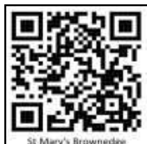
St Mary's Brownedge

Universalis.com: Universalis is a website which provides the Mass texts and readings for each day of the year as well as the Liturgy of the Hours. Online it provides free texts for the upcoming 7 days. Buying the App gives full access. This QR Code will take you straight to the Mass Readings of the day: