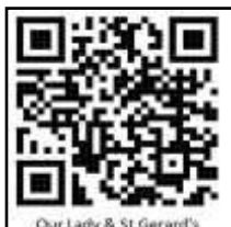
Our Lady & St Gerard's

Donations: Make an online Donation to support our parishes by scanning the QR codes below: